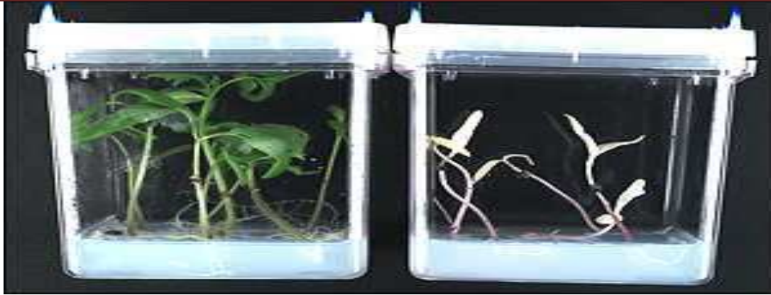
Figure 6 Preparation of Edible Vaccines 3