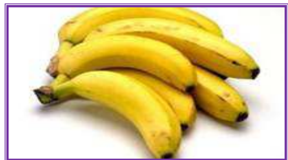
Figure 1 Banana for vaccine 1

Vaccines or subunit vaccinations, Banana is desire vector, Research is leaning towards the use of bananas as the vector since most third-world countries, who would benefit most from edible vaccines, are in tropical climates that are suitable for growing bananas.