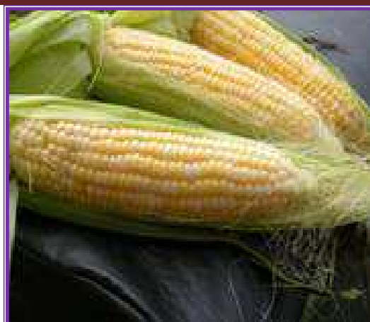
Figure 3 Edible vaccine using maize 5

Maize plants that produce the protein known as HbsAg, maize plants to produce a protein used to make the Hepatitis B virus vaccine.