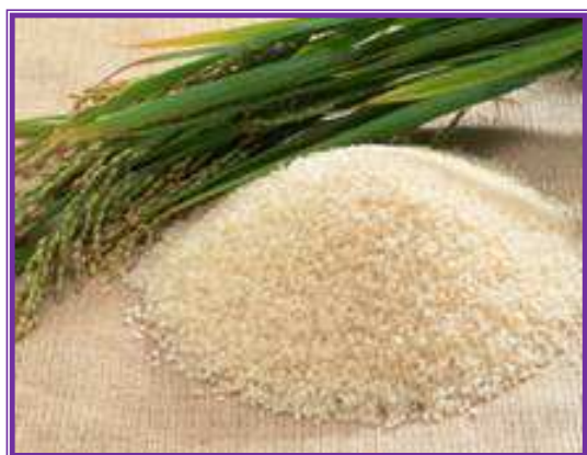
Figure 2 Edible vaccine using genetically modified rice 4

water, it cause the gut and bloody the stool of victims. A vaccine is existing but provides short lived protection; some require refrigeration. But now Japanese researchers have created a strain of rice that can act as a vaccine and last for more than a year and half at room temperature. Vaccine based rice deliver to digestive tract for the initiation of antigen-specific mucosal and systemic immune responses.