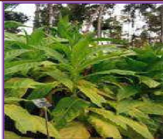
Figure 5 Edible vaccine using tobacco 7 .

Human papilloma viruses are the causative agent for cervical cancer, being also involved in skin, head, and neck tumors. More than 150 different types of Human papilloma virus (HPV) are known. The most commonly found HPVs in cervical carcinomas are HPV 16 and 18. Virus proteins E6 and E7 are known as onco-proteins, these are promising target for the development of HPV-associate tumors. The HPV16 E7 protein in the cytoplasm of tobacco ( nicotiana benthamiana ) plants. The E7 production level was fivefold higher (15 microgram of protein per gram of fresh leaf)